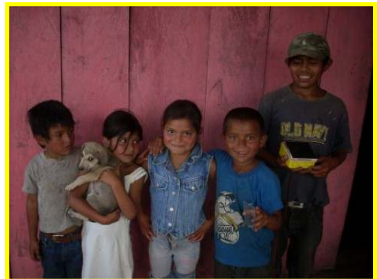
CHILDREN IN NORTHERN NICARAGUA HOLD A BRIGHT NEW IDEAS SOLAR PANEL AND A PUPPY.