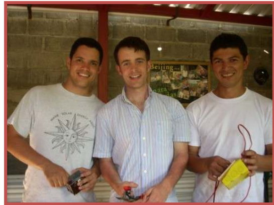
BRIGHT NEW IDEAS ENGINEERS IN NICARAGUA

Bright New Ideas has set a challenge to raise $5,000 by July 15, 2008 to purchase materials, ship, and collect feedback data for the 100 families participating in the Tega-Lamp project . This project will pave the way for a leap to 10,000 lamps on an extremely cost-effective level in 2009. Today your donation makes an immediate impact – like turning on a light switch – in the lives of people in Nicaragua. Visit our website to donate online, and to read our blog for news about solar energy, LED lighting, and the communities we serve.