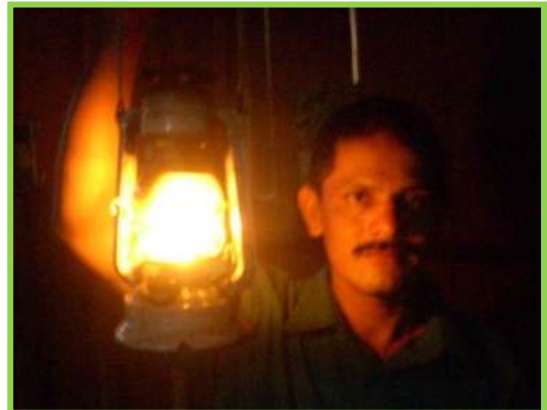
EXAMPLE OF A HARMFUL, SMOKE-PRODUCING KEROSENE LANTERN

We are currently devoted to a region in Northern Nicaragua where over 80% of the rural population has no access to electricity . In March 2008 we launched our Tega-Lamp project , in which we will sell 100 subsidized lamps by September 2008 in partnership with AVODEC, a local NGO with a proven record of lasting change.