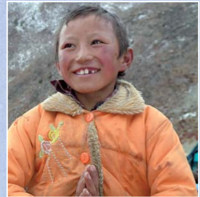
Boy in Jang, Limi