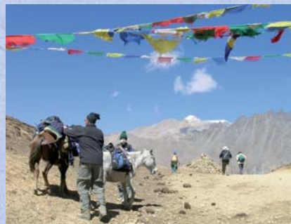
Horses and trekkers at Nara Lagna Pass (OM)