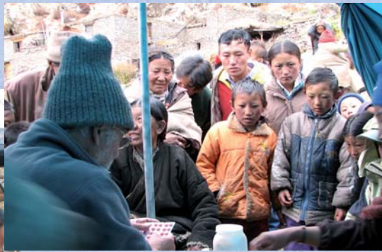
Crowds gather at health camp