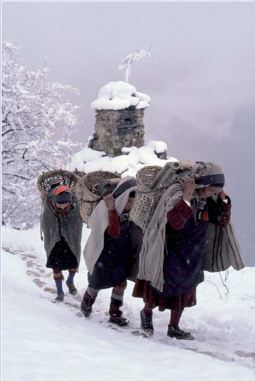
Life in the Himalayas

WORKING WITH HEALTH, COMMUNITY DEVELOPMENT AND HOPE IN THE "HIDDEN HIMALAYAS" ISSUE No.9