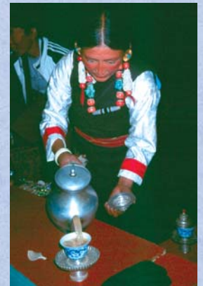
Jang Hospitality (OM)