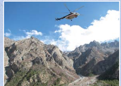
Helicopter over Limi (OM)