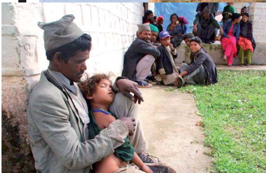
Father and child wait at health camp