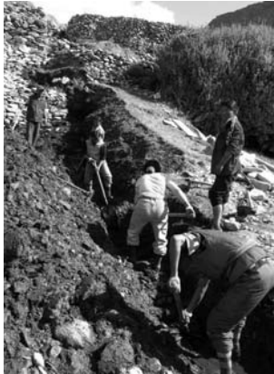
Village women dig foundations (OM)

Health Camp '06 - An international team of doctors, dentists, technicians, and nurses from six countries, including Nepal, ran a health camp at the district hospital in Simikot, Humla. Hundreds of surgical procedures were performed and a wide variety of health education services provided. See Jamie Hogg's report on page 6.