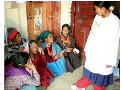
The waiting room