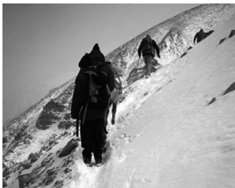
Rotarians trekking with the Nepal Trust

Til Solar Project - RC Ilkley Wharfedale (D.1040) - in preparation - estimated completion Sept 07