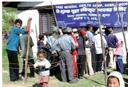
Queues form outside

I am now working in Kathmandu and hear feedback from various sources. There is great interest from Nepalese doctors, nurses and paramedical staff here to volunteer for future camps. This seems a vote of confidence in what was achieved and an interest in what could be done in the future.