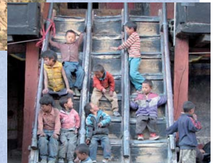
Boys at Halji Gompa