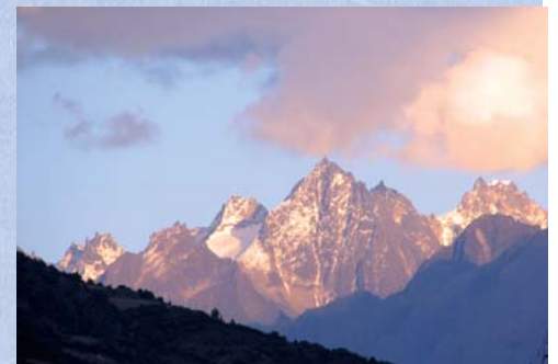
Mountain at sunrise

The Nepal Trust 4 Marina Quay, Lossiemouth, IV31 6TJ Scotland Tel: 01343 810358 Fax: 01343 810359 E-mail: admin@nepaltrust.org