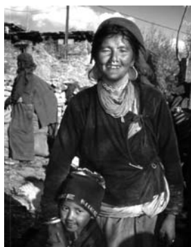
On behalf of the people of 'The Hidden Himalayas', thank-you!

Over the same period, we received gifts/grants of £500 or more from the following trusts and companies: The Allan & Nesta Ferguson Charitable Trust, UNESCO, Mike Metters Appeal, Nepal Trust Austria, The Ryklow Charitable Trust, The Prince of Wales's Charitable Foundation, The Paget Trust, The Paul Charitable Trust, The Souter Charitable Trust, The Stonewall Park Charitable Trust, The Bury Walker Trust, The Rhododendron Trust, Jo Hambro Capital Management Group, Posthouse Printing, Aesculapius Lodge.