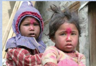
Children in Limi (OM)