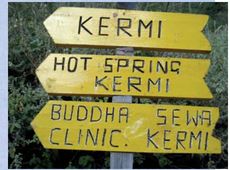
Signpost to clinic